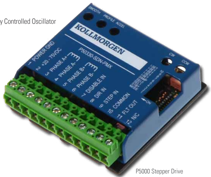
P5000 Stepper Drive (Shown Actual Size)