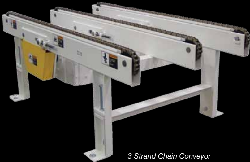
3 Strand Chain Conveyor