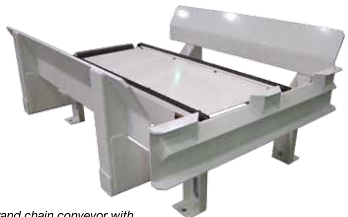
2 strand chain conveyor with funneling load guides, filler plate and fork pockets