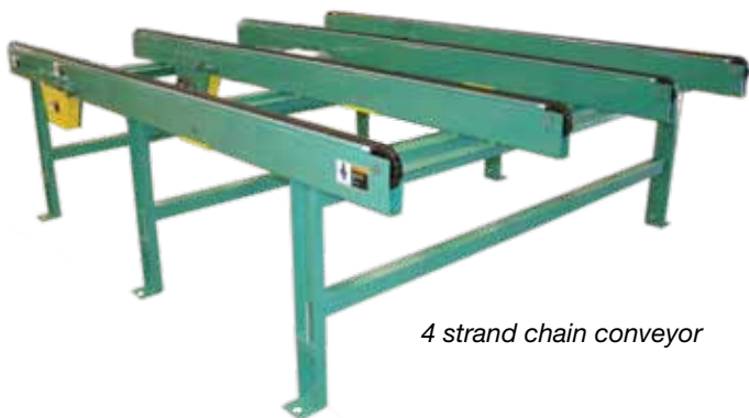
4 strand chain conveyor

Drive Options: Standard center-mounted drive allows chain to be reversed. Drive and pinch points are guarded. End drives and outboard drive packages are available.